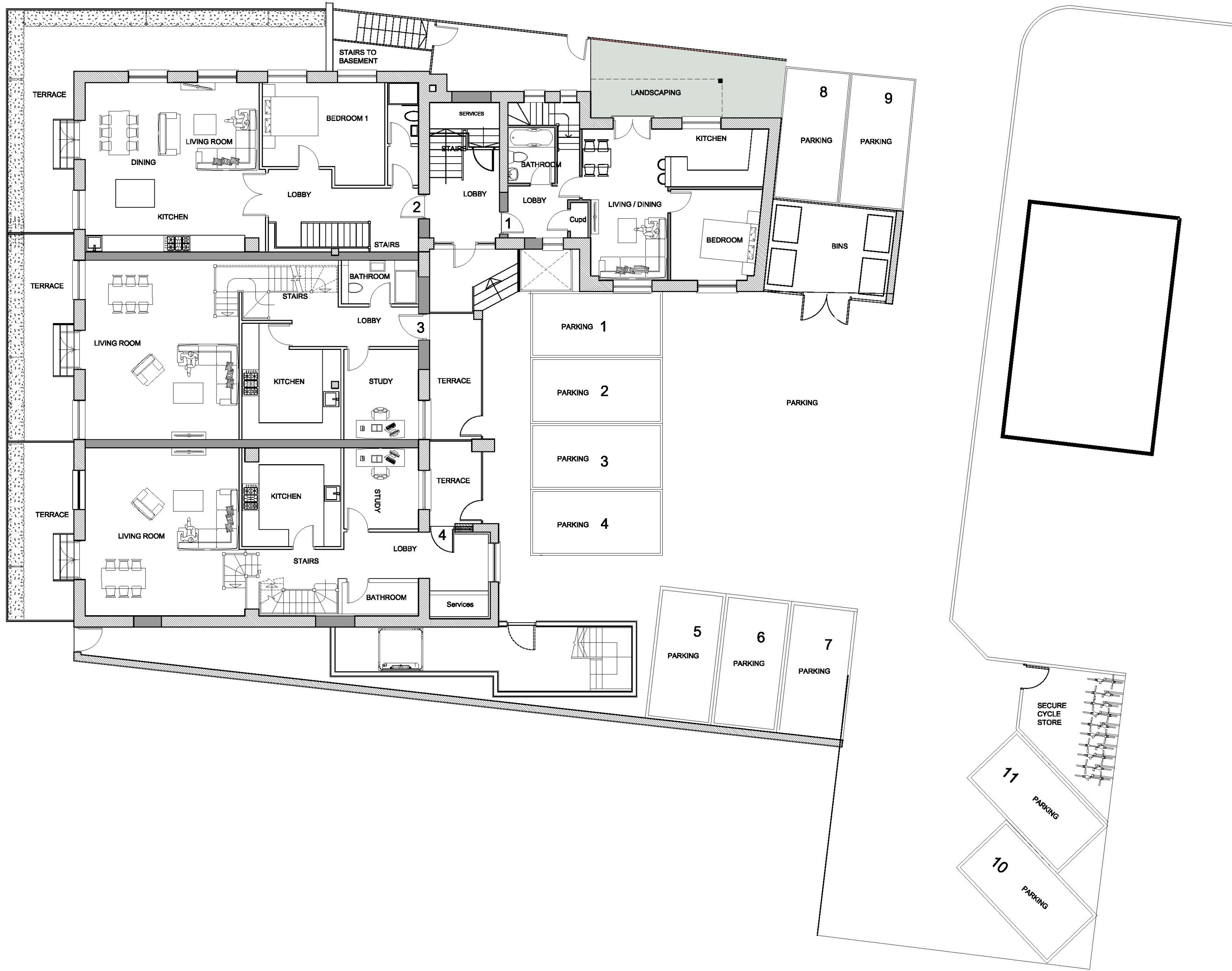
PROPOSED GROUND FLOOR SCALE 1:100